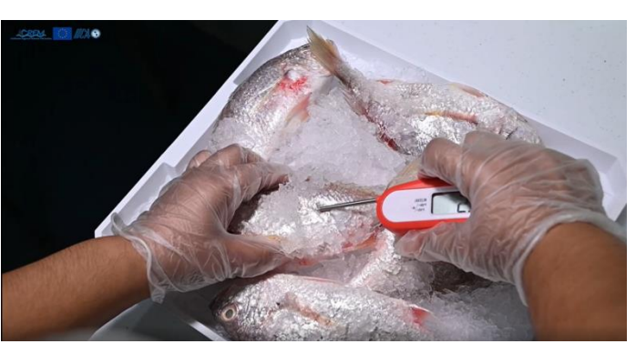
It also showcases videos and modules used to train staff at Suriname's Ocean Delight

Bridgetown, Barbados, 29 March 2023 (IICA): Fish processing establishments and fishers across the Caribbean now have access to a new online hub of fisheries food safety resources. The Inter-American Institute for Cooperation on Agriculture (IICA), in partnership with the Caribbean Regional Fisheries Mechanism (CRFM) today announced the launch of the new Fisheries Food Safety Hub, developed with funding from the European Union (EU) under the 11<sup>th</sup> European Development Fund (EDF) Sanitary and Phytosanitary (SPS) Measures Project.