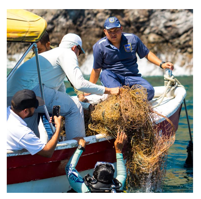
'Ghost gear' or ALDFG is not just a problem in the Caribbean but globally. In this photo, GGGI facilitated the removal of 'ghost gear' in Panama.

However, notable advancements have already been made through the CRFM-GGGI cooperation to date. In 2022, the CRFM collaborated with the GGGI and the Gulf and Caribbean Fisheries Institute (GCFI) to develop a Caribbean Regional Action Plan to Prevent ALDFG. The parties also collaborated on surveys of fishers and other stakeholders, which indicated that ALDFG is widespread in the Caribbean. Traps and nets are the most prevalent and most harmful forms of ALDFG, according to the GGGI Best Practice Framework for the Management of Fishing Gear.