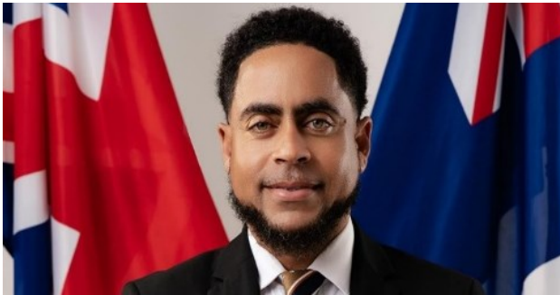
The newly elected chair of the CRFM Ministerial Council - Honourable Kyle Hodge of Anguilla

Hon. Hodge said: "we will forge resolutely ahead with... actions aimed at ensuring safe, healthy and fair working and living conditions for over half-million fishers, fish workers, and others employed across our fisheries and aquaculture value chains."